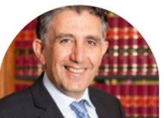
JUSTICE BROMBERG AUS LAW REFORM COMMISSION