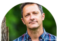
PROF BRENDAN WINTLE BIODIVERSITY COUNCIL