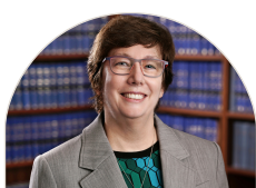
HON JUSTICE JAGOT HIGH COURT OF AUSTRALIA