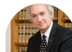
SIMON MOLESWORTH AO KC VICTORIAN BAR