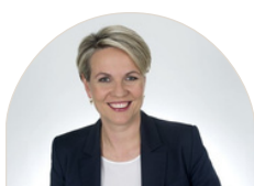
HON TANYA PLIBERSEK MP FEDERAL ENVIRONMENT MINISTER